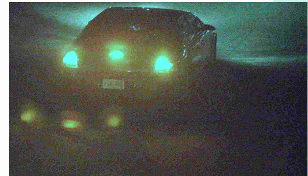
Violent Wanted Criminal