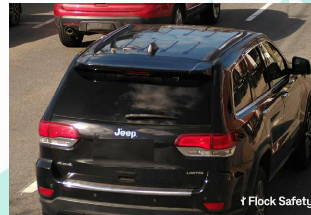
Stolen Motor Vehicle